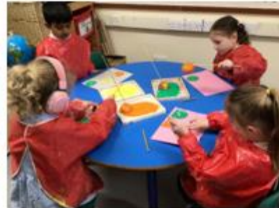
Investigating the process from field to fork.