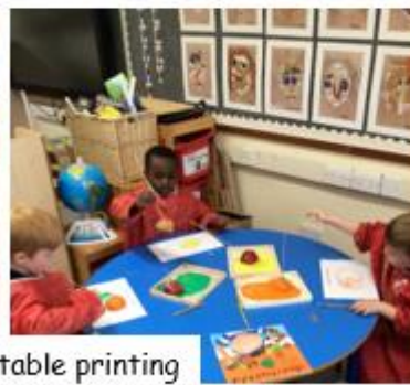
Fruit and vegetable printing