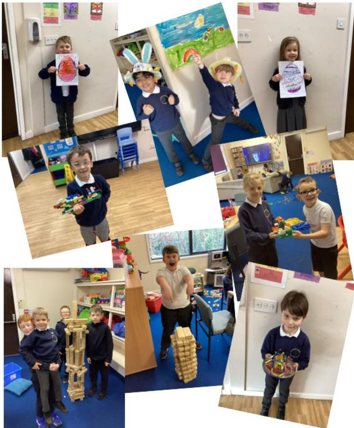
Afterschool club FUN!