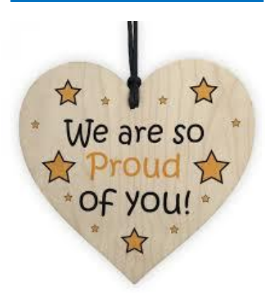
Pupils We Are Proud Of

all of the children have progressed since their initial concert. We look forward to seeing what they have in store next year.