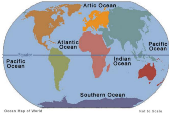
Ocean Map of World Not to Scale

Children have looked at ariel views of simple places, such as the school.